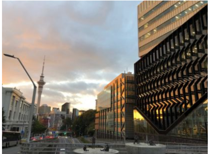
Science building, the location of the Centre for Brain Research

The Diagnostic and Statistical Manual of Mental Disorders (5th ed.; DSM-5 ; American Psychiatric Association, 2013), reference in the area, brings dyslexia as “an alternative term used to refer to a pattern of learning difficulties characterized by problems with accurate or fluent word recognition, poor decoding, and poor spelling abilities” (p.67), more specifically, dyslexia involves “difficulties learning to map letters with the sounds of one's