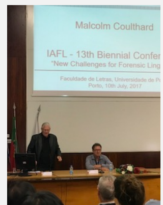
Plenary talk by Dr. Coulthard

The city of Porto is an incomparable attraction and the Portuguese people are lovable and welcoming, not to mention the diverse codfish dishes we savored in great delight. The photos depict our joy in participating in this highly important event for Forensic Linguistics and for collaborations between universities.