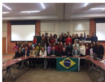
English teachers from the Brazilian Federal Institutes meet with the CONIF delegation

In this sense, the course brought many insights that can be applied in our pedagogical practices at IFSC. For example, we were able to develop a project - entitled "IFSC, my community and I" - to be