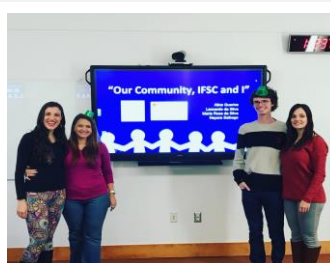
English teachers from IFSC present their final project

Throughout the nine-week program, we had workshops on different approaches to the teaching