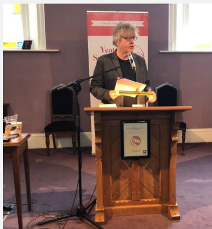
Paul Muldoon during his lecture "Zigzag Wantonness: Yeats and Form"