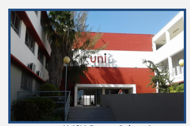
UniCV Campus Palmarejo

provided me with a place to work at the university and offered all the technical support I needed.